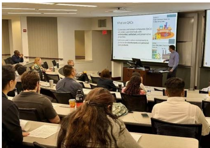
Presentations at the 2025 postdoc symposium

Our Annual Spring Research Symposium is coming up fast on Friday, May 22 nd from 9:00 am - 5:00 pm in the Coverdell Center (S175, Lobby and Rotunda) on Athens Campus. All UGA postdocs are invited to attend and present their research.